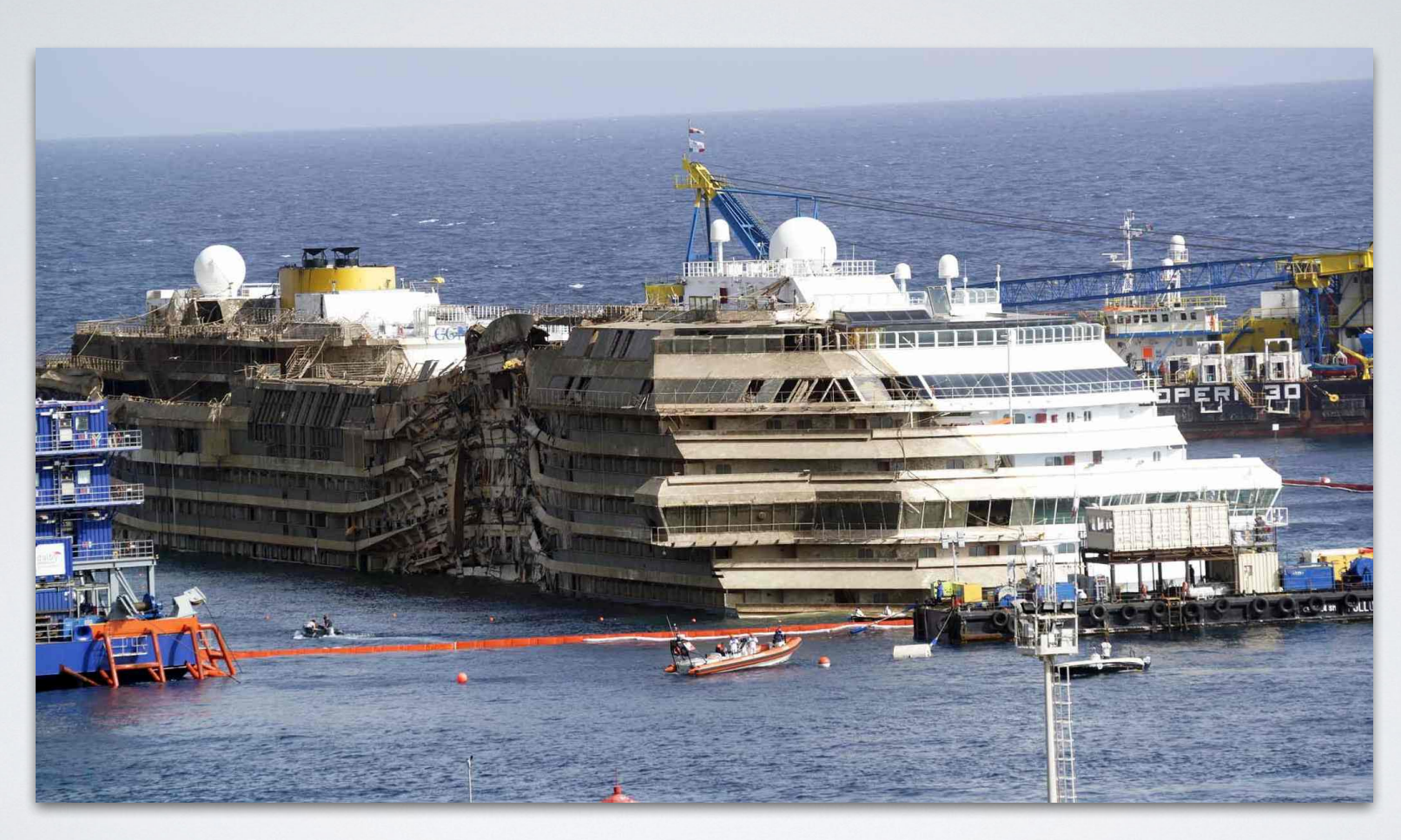
Costa Concordia Salvage Operation - Step 3