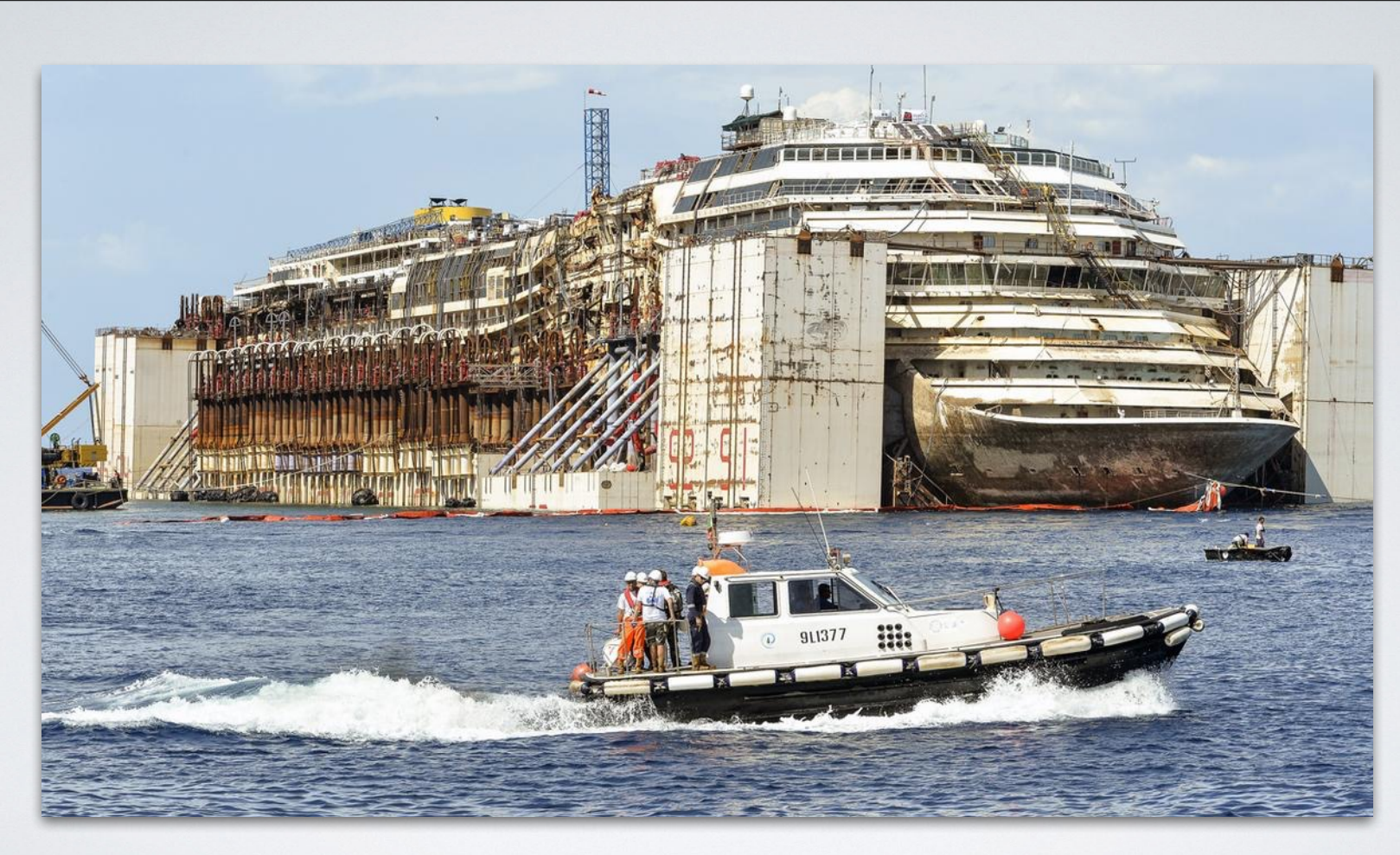
Costa Concordia Salvage Operation - Step 4