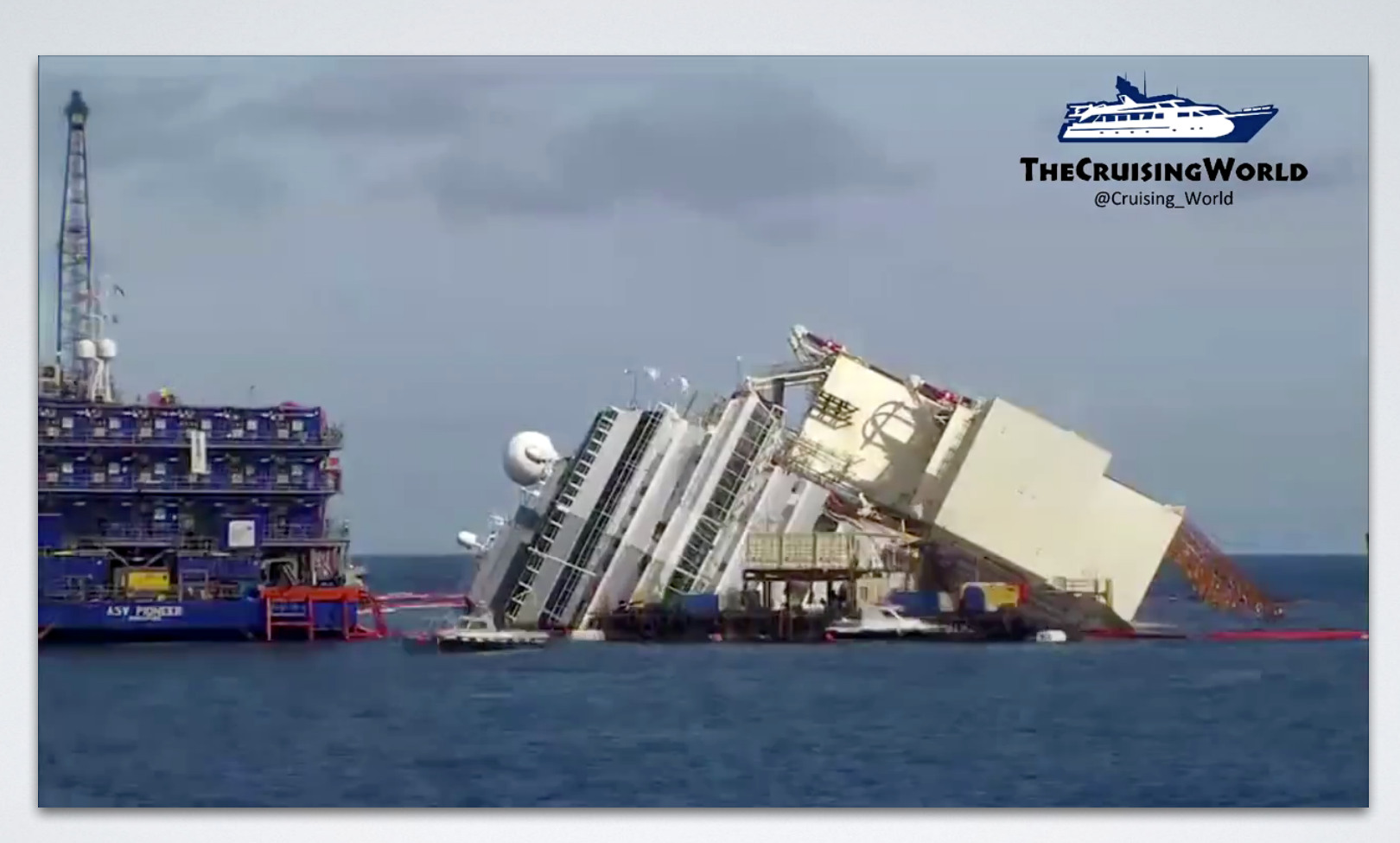
Costa Concordia Salvage Operation - Step 2