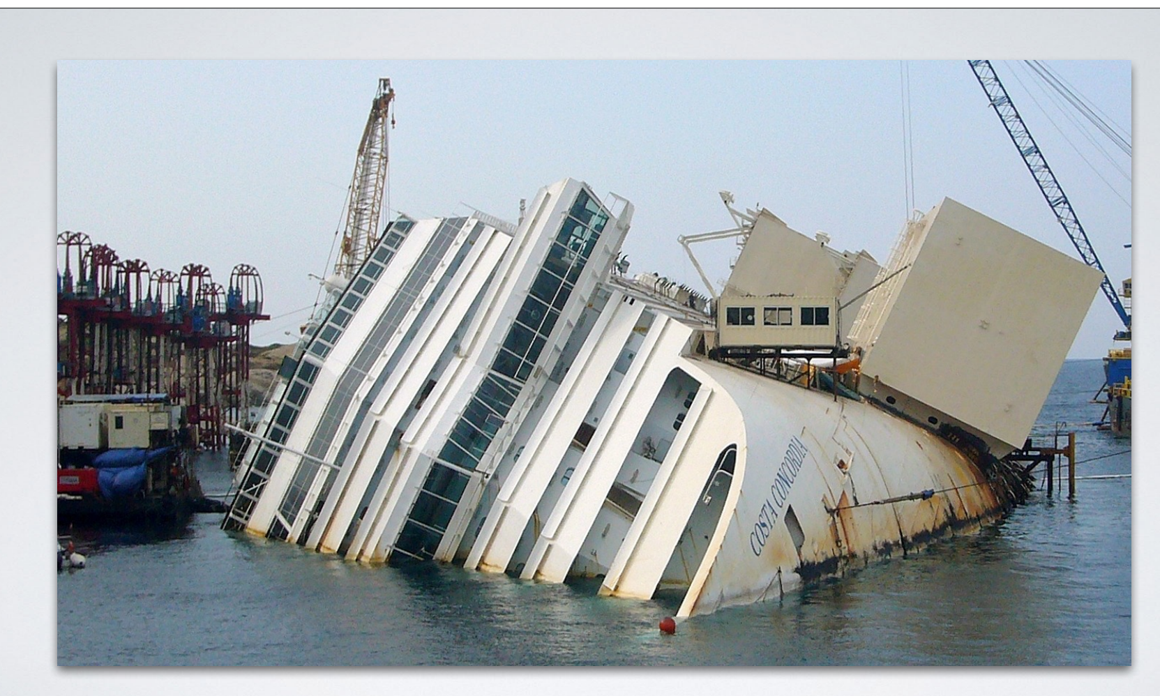
Costa Concordia Salvage Operation - Step I