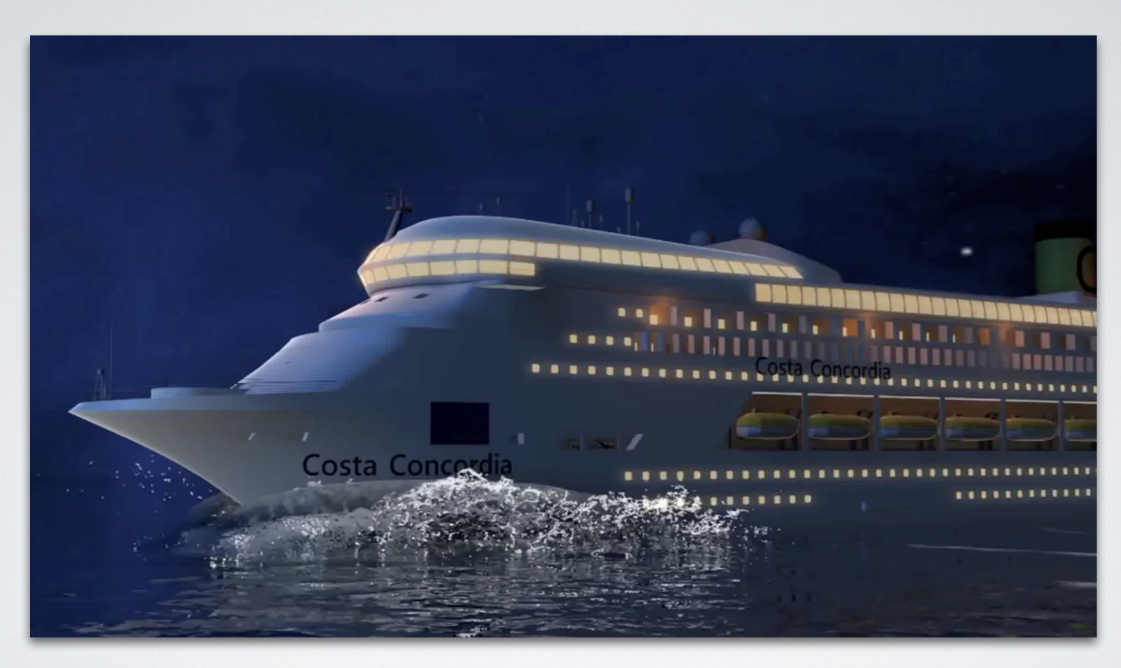
Costa Concordia Hits Reef